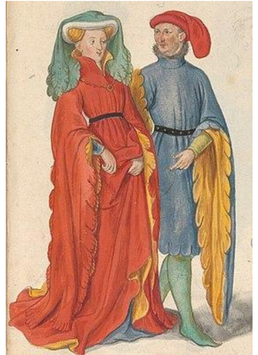
A Flemish lady and gentleman in the year 1400, illustrated in the manuscript "Théâtre de tous les peuples et nations de la terre avec leurs habits et ornemens divers, tant anciens que modernes, diligemment depeints au naturel".