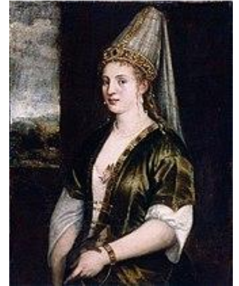
Suleiman the Magnificent and his wife Hürrem Sultan.