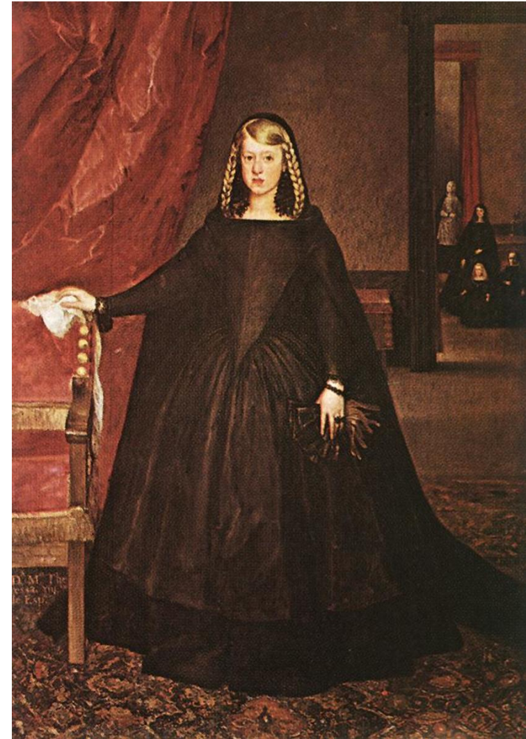
Margarita Teresa of Spain in mourning attire circa 1666