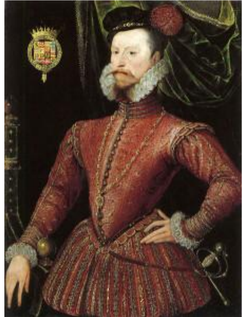
Robert Dudley, Dressed Head to Toe in Silk