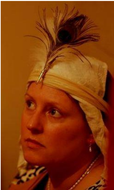
carqad and aigrette