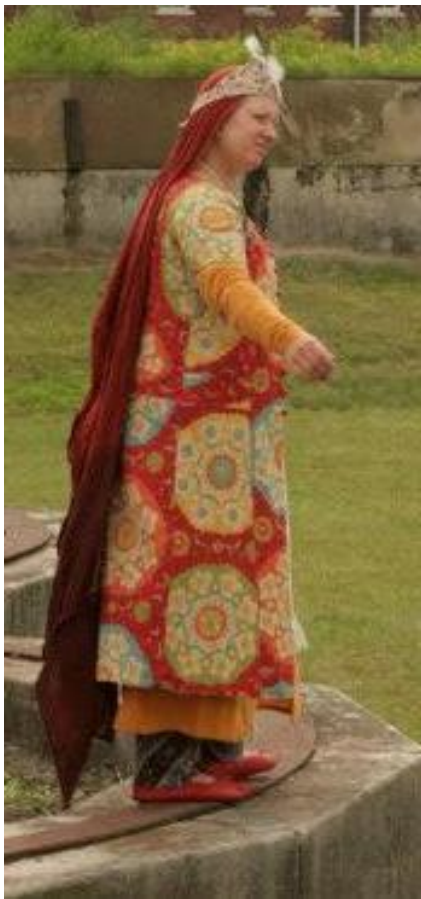
cador, carqad, and aigrette