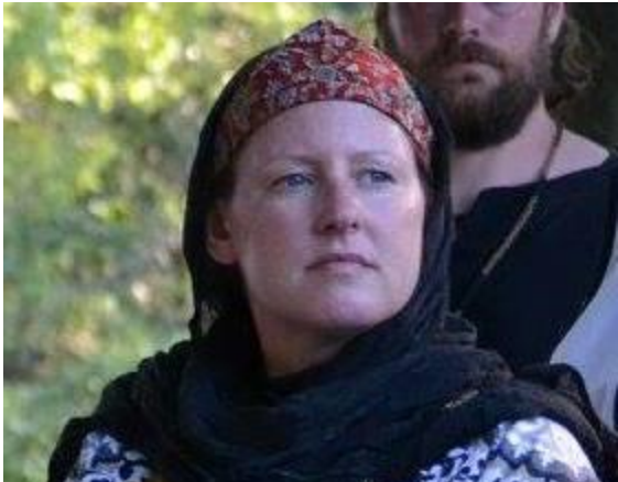
carqad and carghat