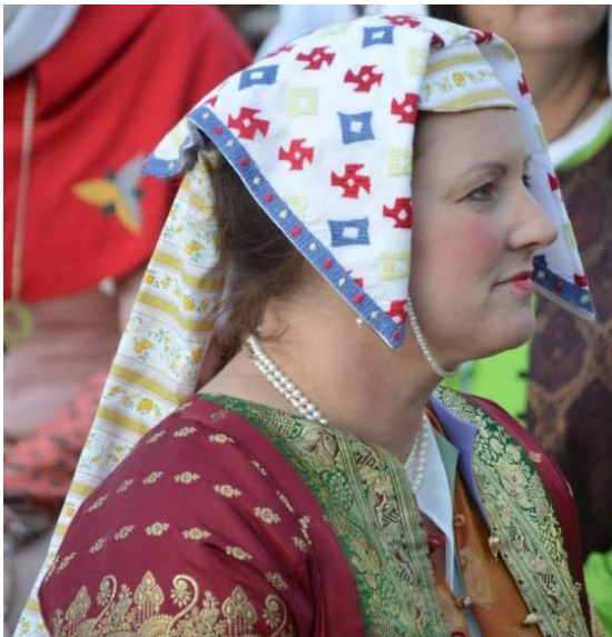
braid case and carqad