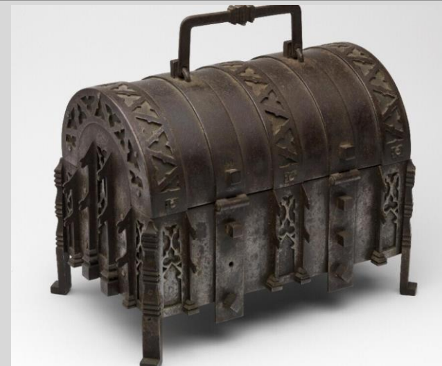
Chest for Spices